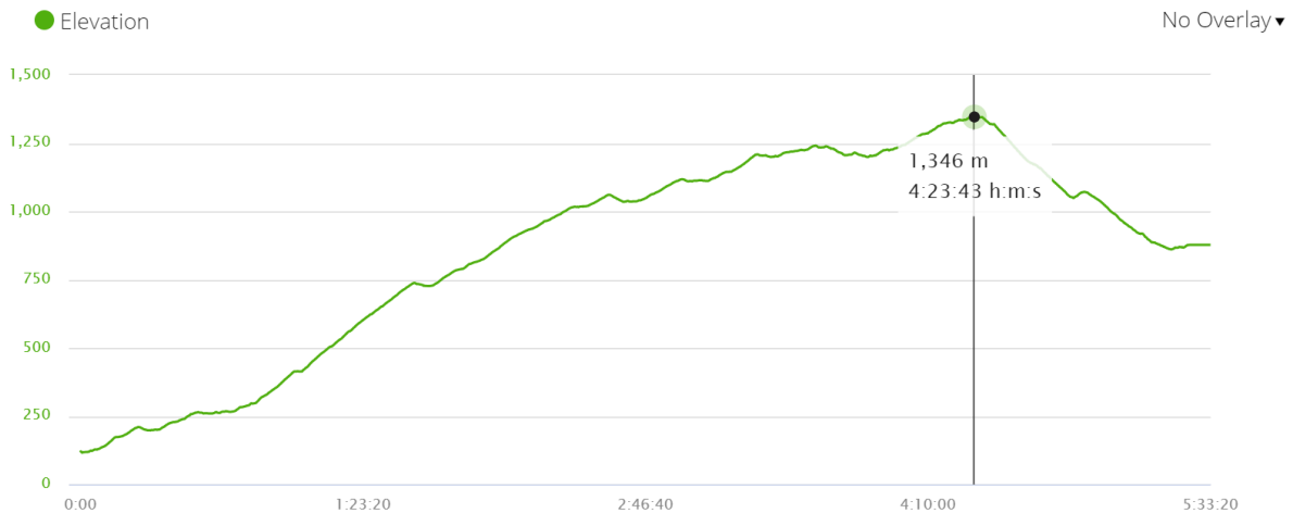
Elevation profile stage 1