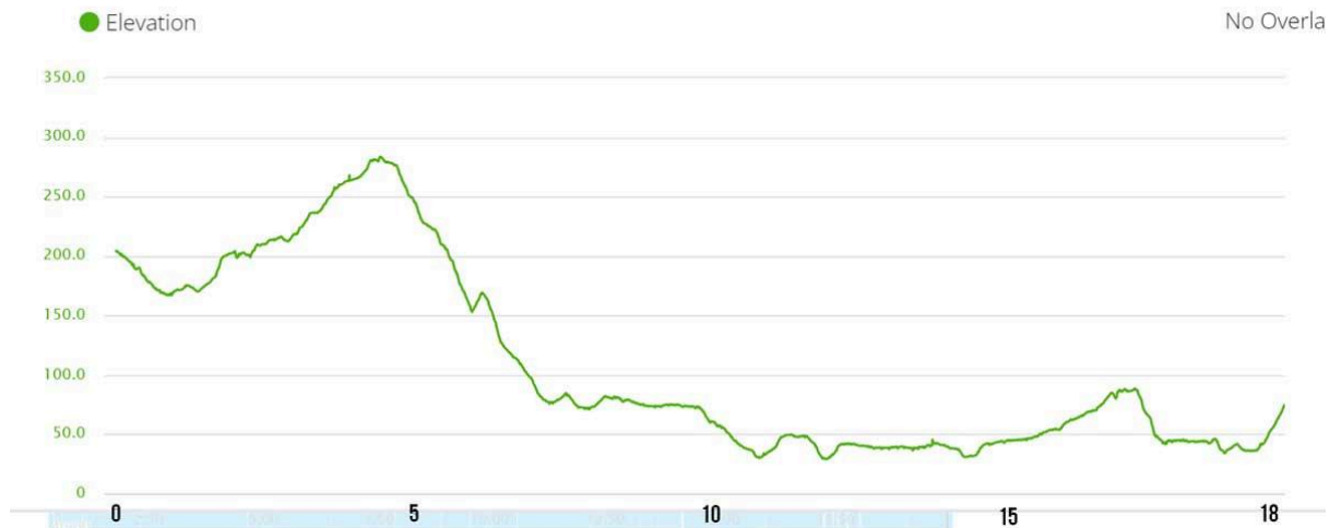
Stops along the route stage 4