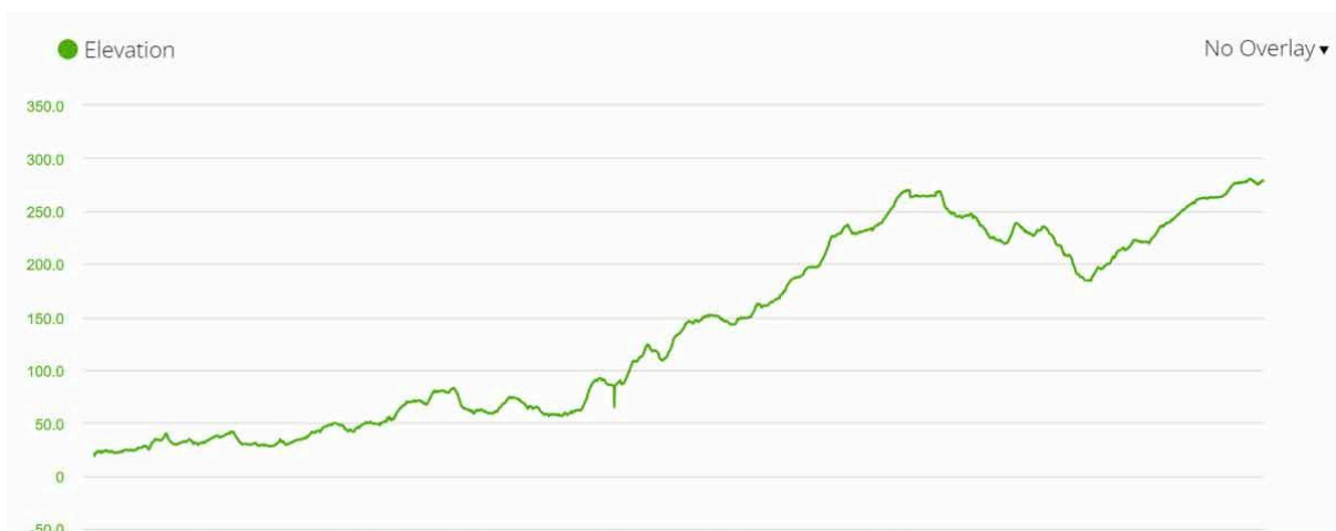
Elevation profile stage 5