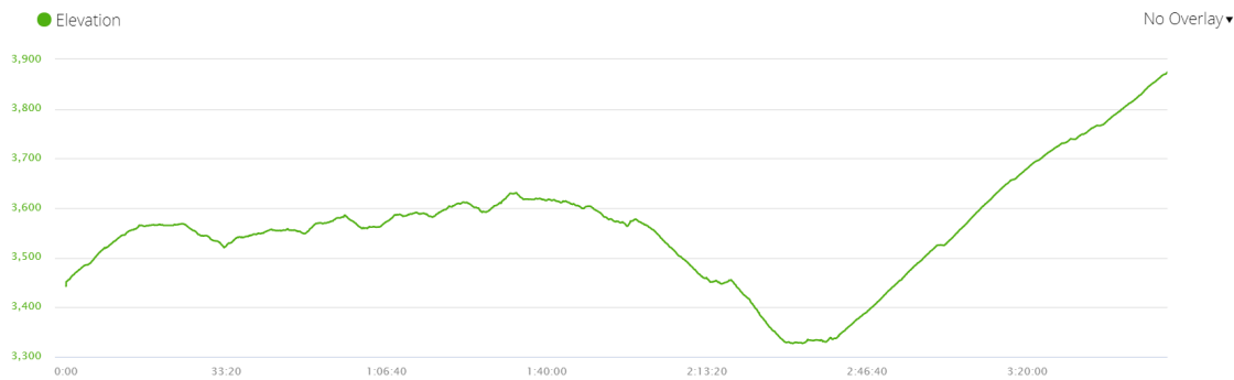
Stops on the route from Namche Bazar to Tengboche