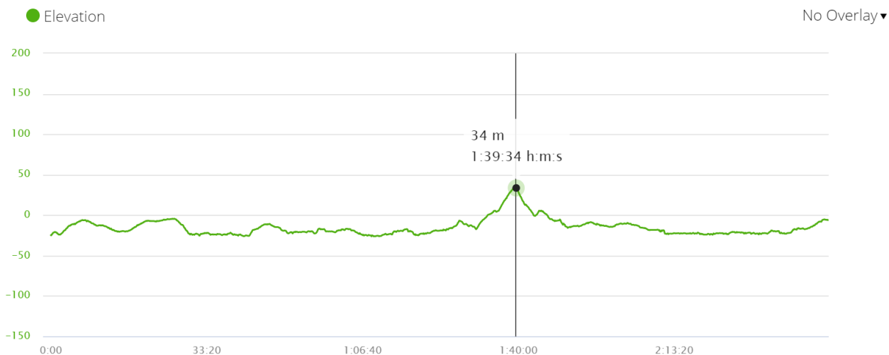
Stops along the route