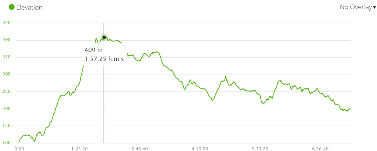
Stops along the route