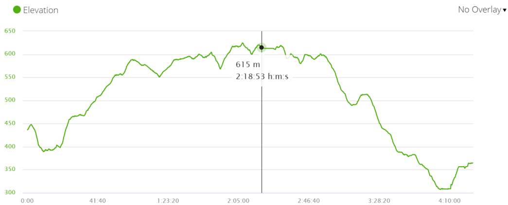
Stops along the route