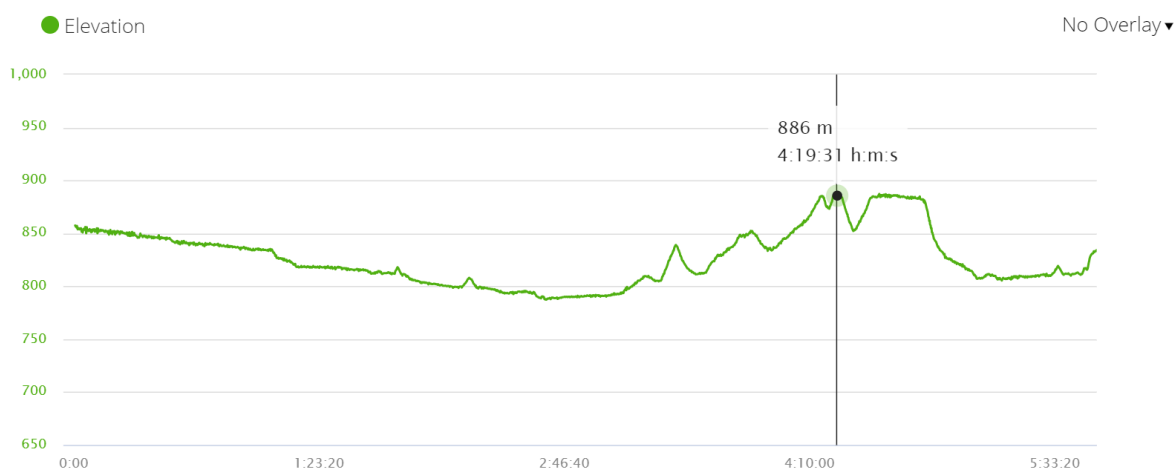
Stops along the route