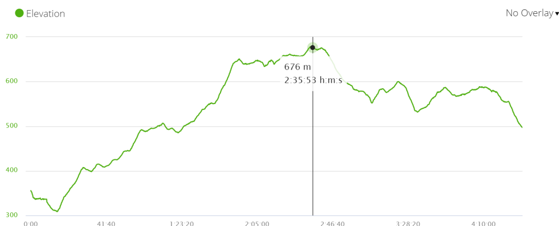
Elevation profile Stage 30