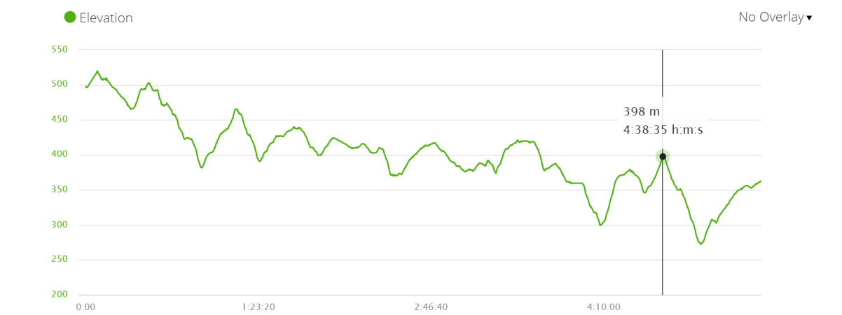
Stops along the route