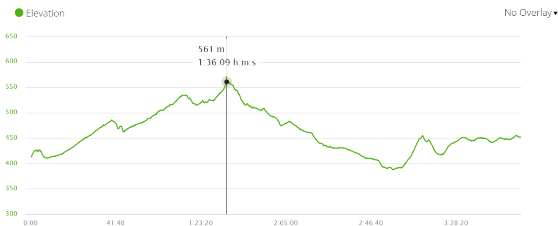
Stops along the route