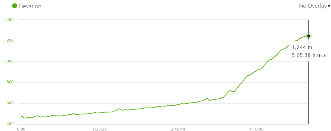
Stops along the route