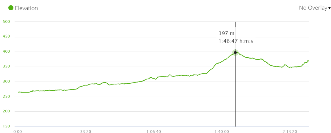
Stops along the route