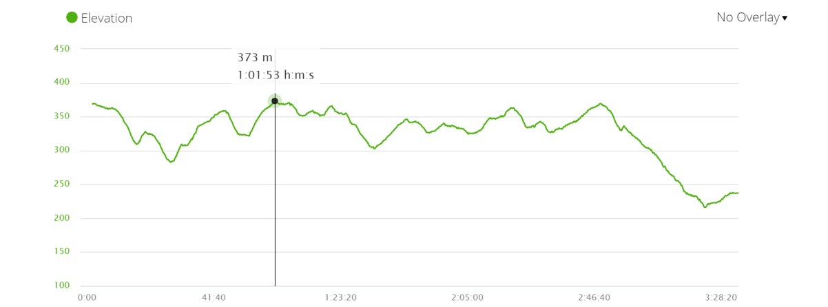
Elevation profile Stage 32

Stingy Nomads - Travel Blog https://stingynomads.com/camino-frances-walking-itinerary/