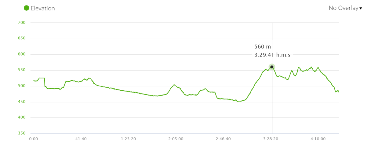
Stops along the route