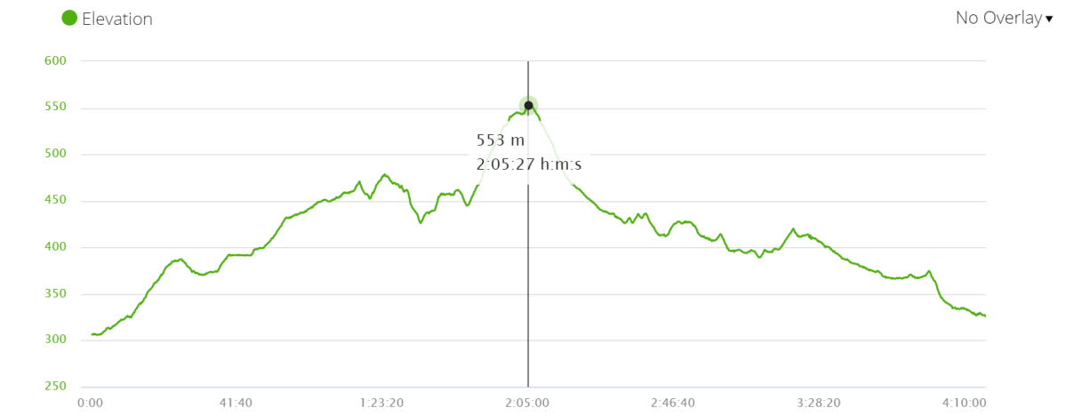
Stops along the route