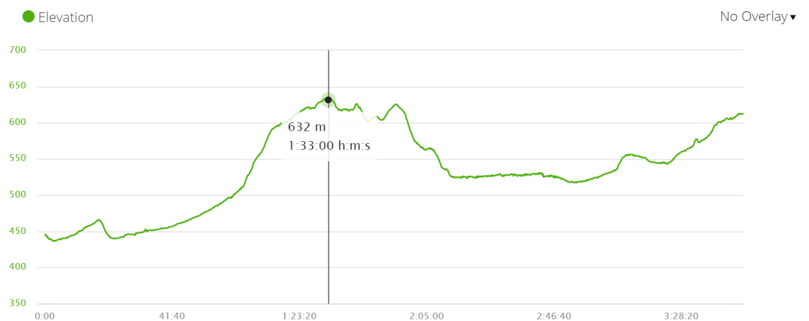
Elevation profile Stage 10