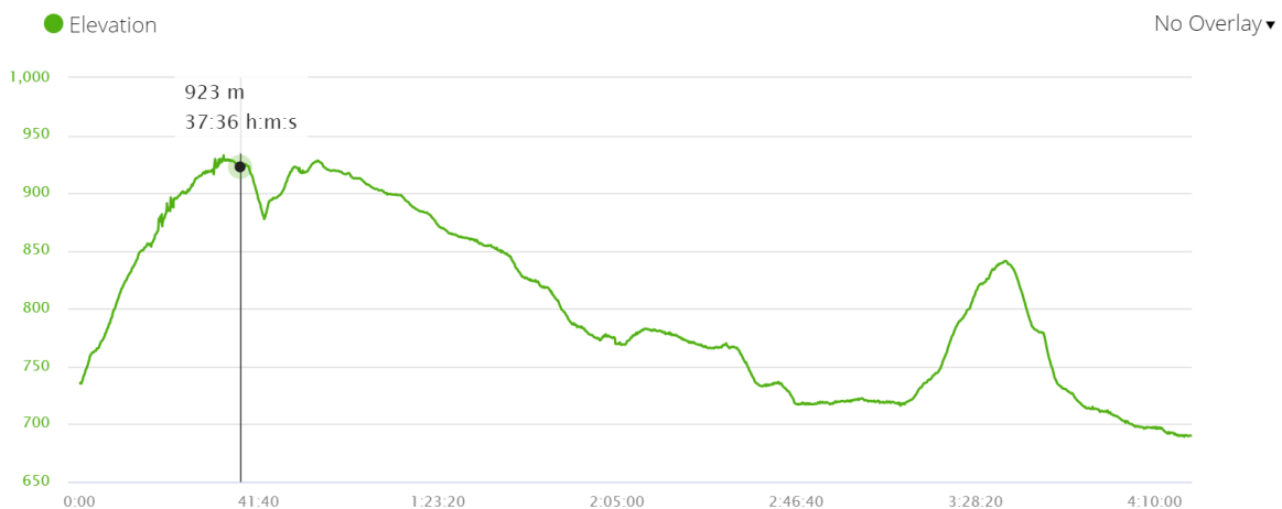
Elevation profile stage 12