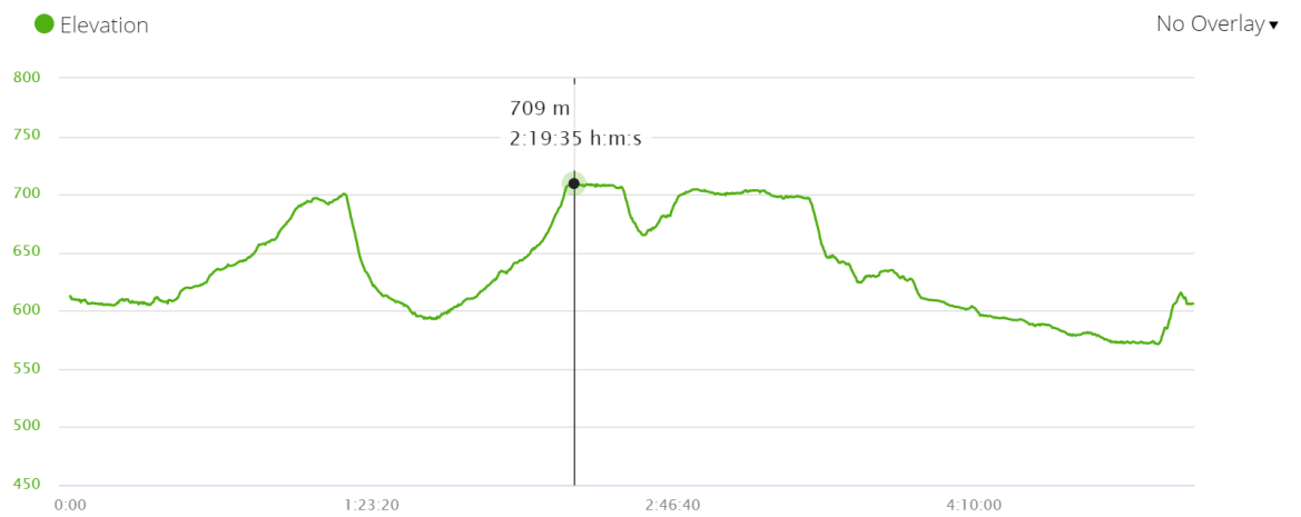
Stops along the route