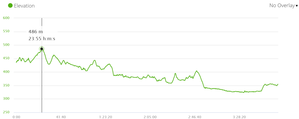
Stops along the route