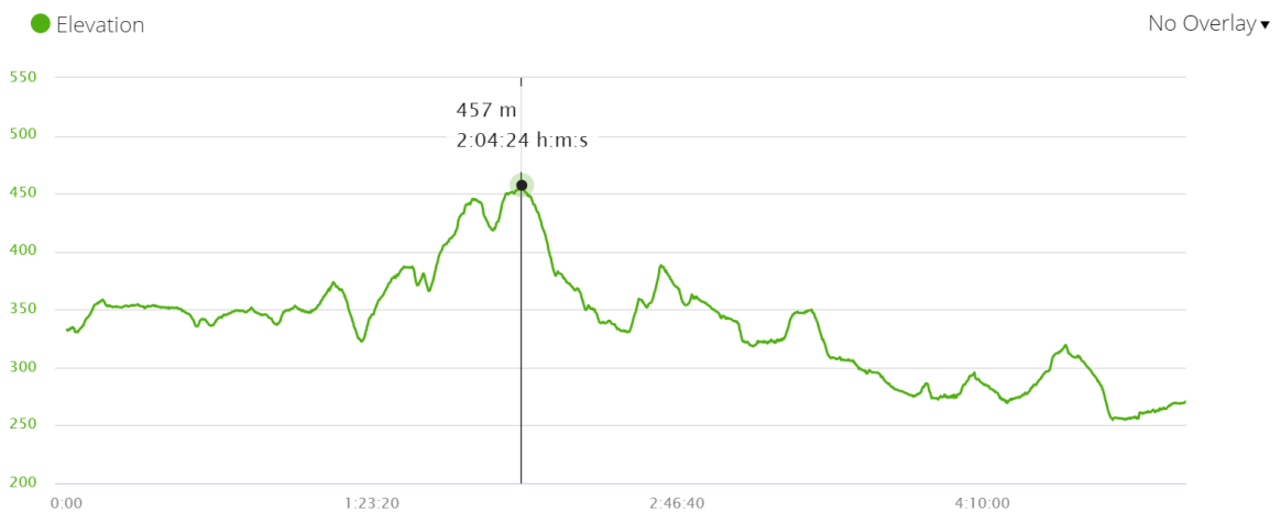
Stops along the route