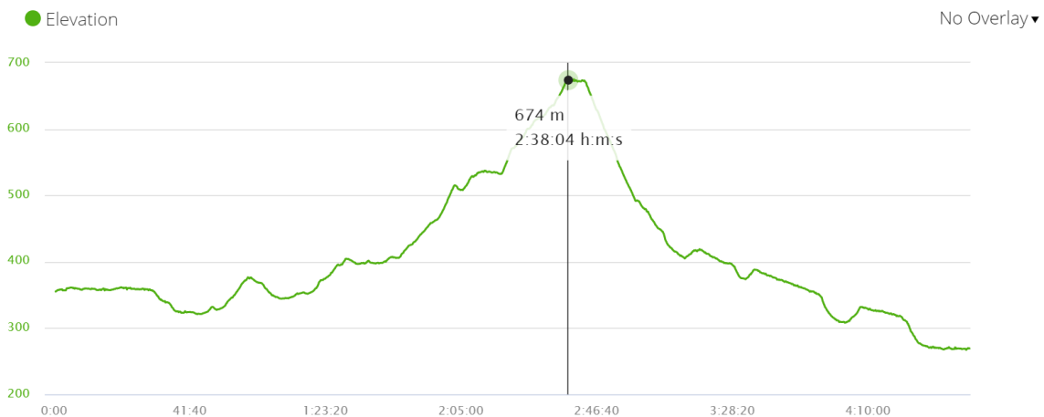
Stops along the route