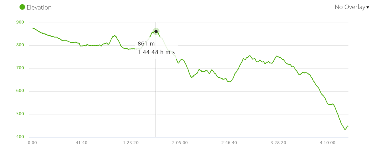
Stops along the route