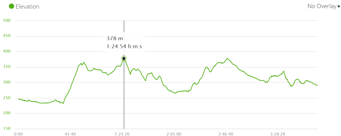
Stops along the route