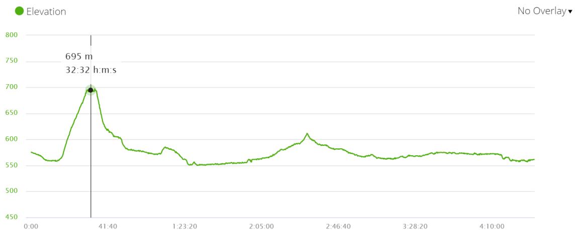
Stops along the route