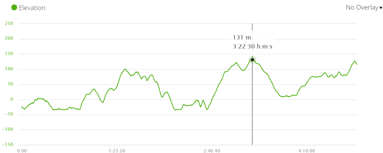
Stops along the route