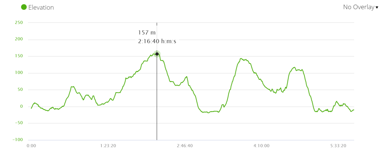
Stops along the route