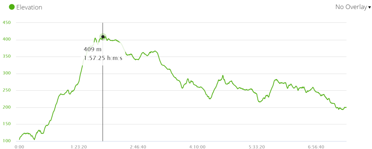
Stops along the route